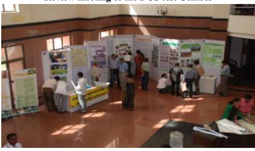
View of the exhibition of DUS test centers