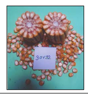
fp= 05 %

Figure 05c: General view of glume and grain