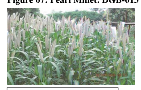
fp= 07% Figure 07: General view of crop