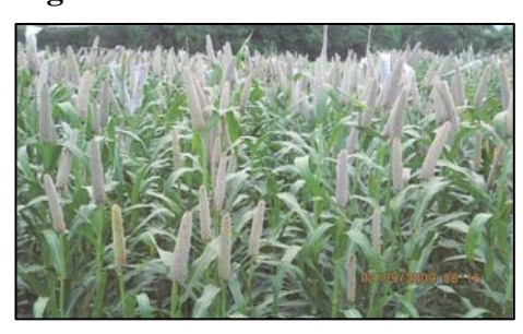
fp= 08% Figure 08: General view of crop