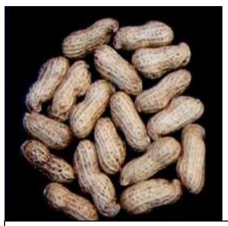
Figure 34 a: General view of pods

crop/denomination : Groundnut/Gujarat Junagarh Groundnut-17 (JSP-48)