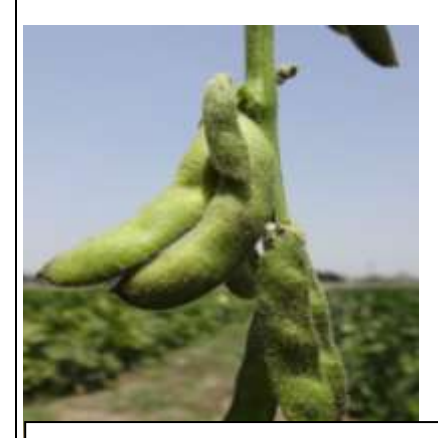
Figure 31: General view of pods

crop/denomination: Soybean/Pratap Soya-2 (RKS 18)