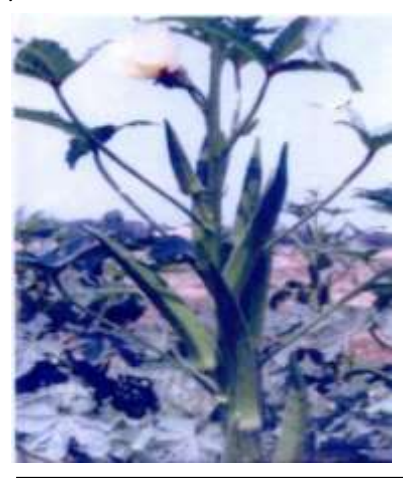
Figure 26: General view of plant

crop/denomination: Okra/Kashi Bhairo (DVR-3)