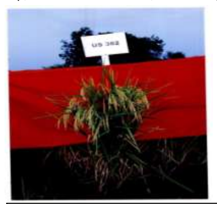
Figure 04: General view of plant

crop/denomination: Rice/ US 382 (IET 20727)