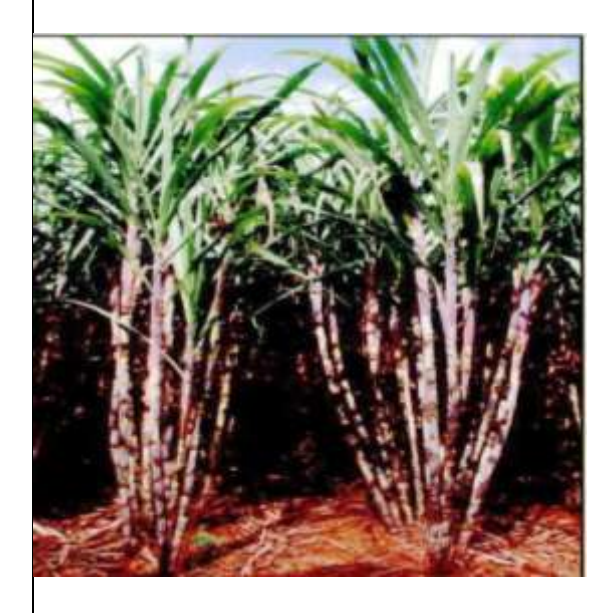
Figure 07: General view of plants6

crop/denomination : Sugarcane/ CoVSI-9805