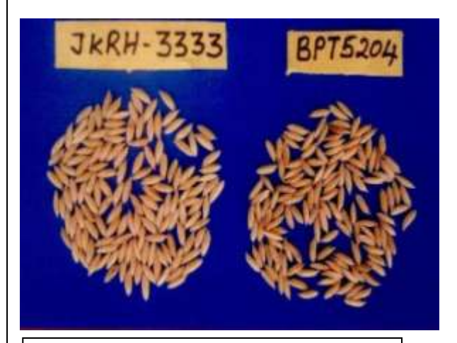
Figure 11: General view of grains

crop/denomination: Rice/ JKRH-3333 (IET 20759)