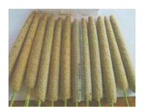
Figure 39. General view of spike

Crop/Denomination: Pearl Millet/ VBBH 3115