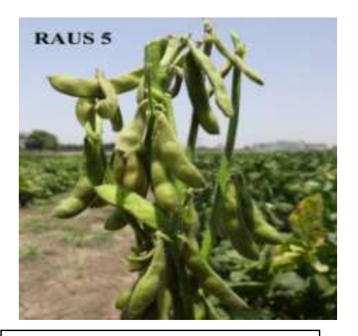
Figure 32: General view of pods

crop/denomination: Soybean/ RAUS-5 (Pratap Soya-1)