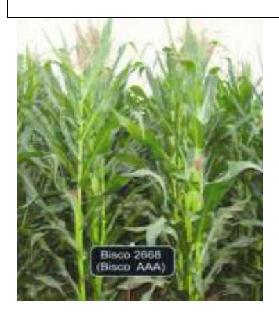
Figure 40: General view of crop

Crop/Denomination: Maize / BISCO 2668 (BISCO AAA)