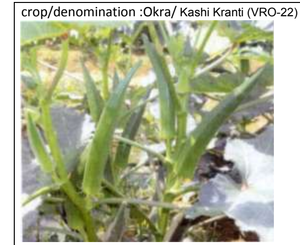
Figure 23: General view of fruits

crop/denomination: Okra/ Kashi Satdhari (IIVR-10)