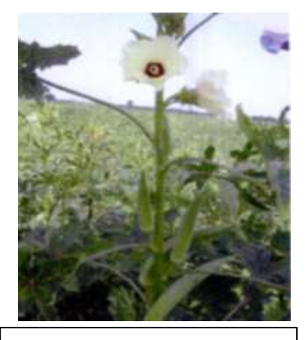
Figure 25: General view of plant

crop/denomination: Okra/ Kashi Satdhari (IIVR-10)