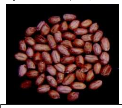
Figure 34 b: General view of kernels

crop/denomination : Groundnut/ Gujarat Junagarh Groundnut-17 (JSP-48)