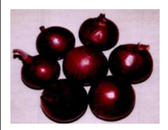
Figure 16: General view of bulbs

Crop/denomination: Onion/NHRDF RED (L-28)