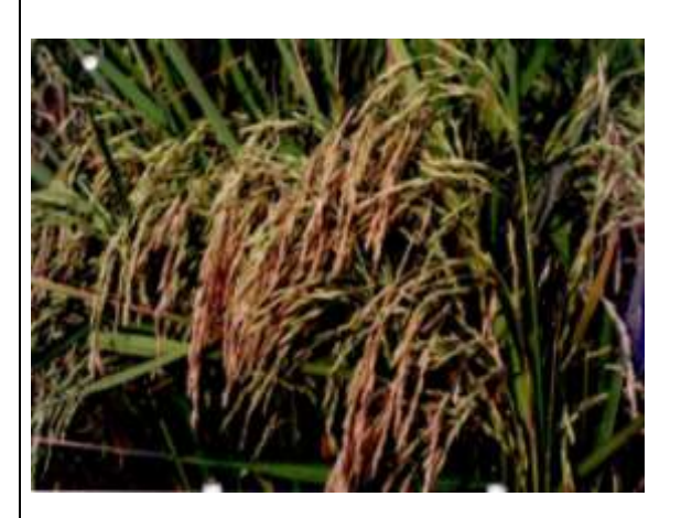
Figure 12: General view of panicles