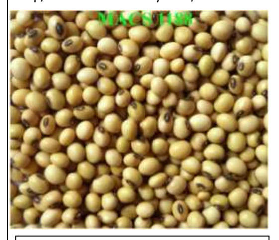
Figure 28: General view of seeds