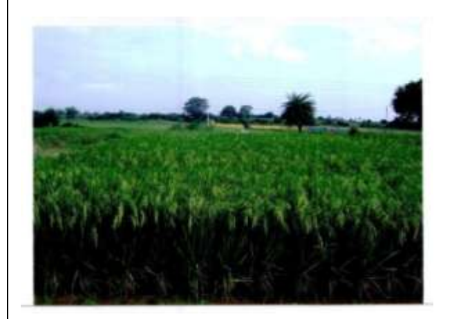
Figure 05: General view of crop

crop/denomination : Rice/ PAC 837 (PAC 85037) (IET 19746)