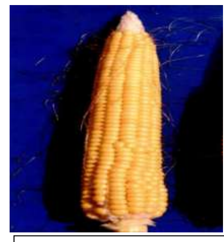
Figure 02: General view of cob

crop/denomination: Tomato/Bhagya (NTH-301)