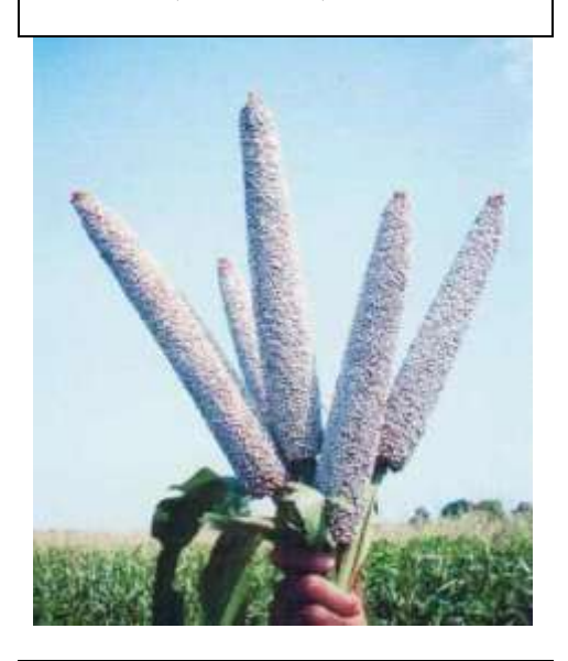
Figure 38.. General view of spike

Crop/Denomination: Pearl Millet / SINDHU (NPH-2475)