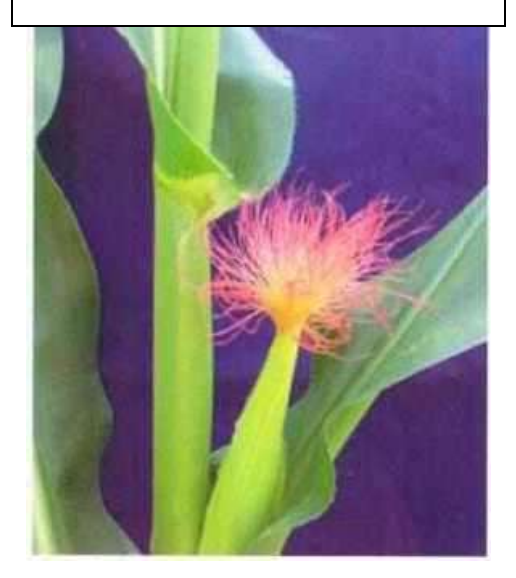
Figure 37. General view of silk colour

Crop/Denomination: Pearl Millet/ VBBH 3115