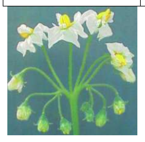
Figure 35: General view of corolla colour