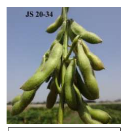
Figure 30: General view of pods