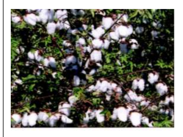
Figure 06: General view of boll opening

crop/denomination : Sugarcane/ CoVSI-9805