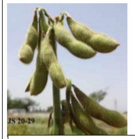
Figure 29: General view of pods