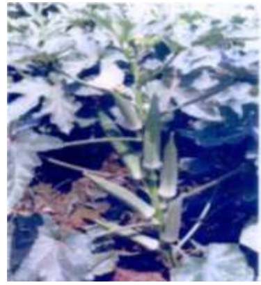
Figure 24: General view of fruits

crop/denomination: Okra/Kashi Bhairo (DVR-3)