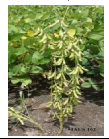
Figure 27: General view of plant