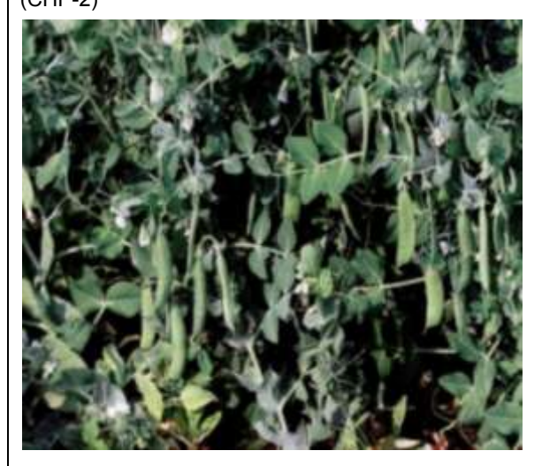
Figure 14: General view of crop

crop/denomination :Garden pea/ Swarna Mukti (CHP-2)