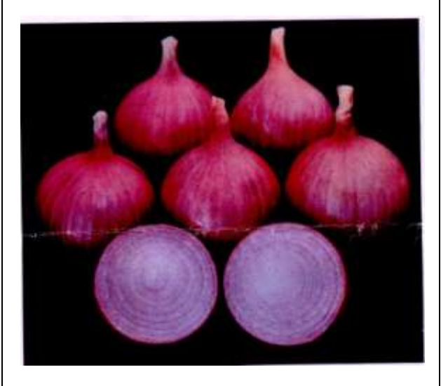
Figure 08: General view of bulbs

crop/denomination : Onion/ Bhima Raj (B-780-5-2-2)