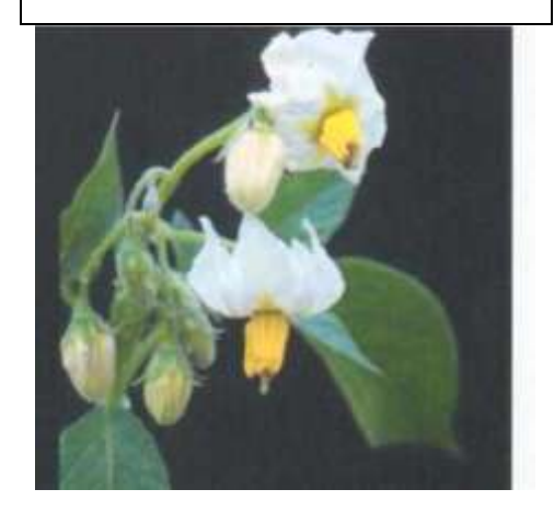
Figure 36. General view of corolla colour