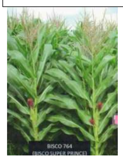
Figure 41. General view of crop