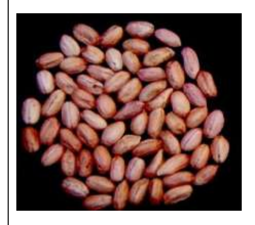
Figure 33b: General view of kernels

crop/denomination : Groundnut/ Gujarat Junagarh Groundnut-22 (JSSP-36)