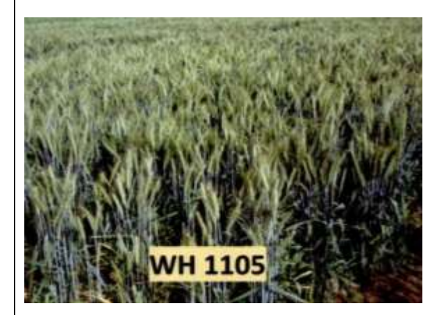
Figure 09: General view of crop

crop/denomination : Onion/Phule Samarth (S-1)