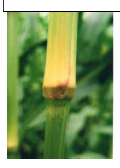
Figure 42. View of node pigmentation