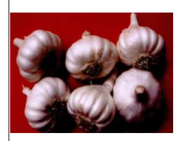
Figure 15: General view of bulbs

crop/denomination: Garlic/ Yamuna Safed-4 (G-323)