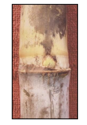
चित्र 08: Figure 08b: General view of bud