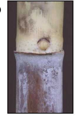
चित्र 07: Figure 07b: General view of bud