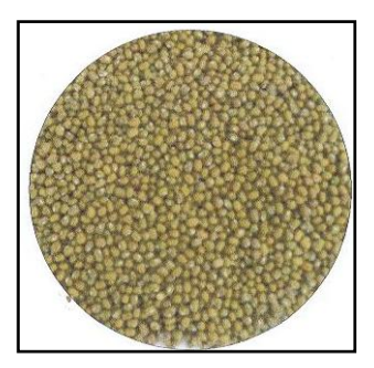
चित्र 01: Figure 01c: General view of seed