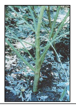
चित्र 02: Figure 02a: General view of stem