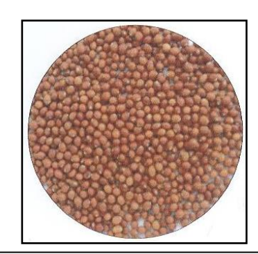
चित्र 02: Figure 02c: General view of seed