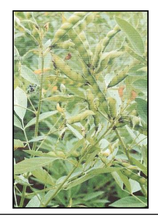
चित्र 02: Figure 02b: General view of pods before maturity