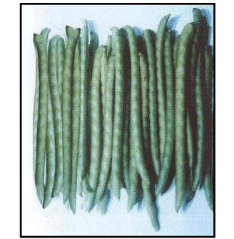
चित्र 01: Figure 01b: General view of pods