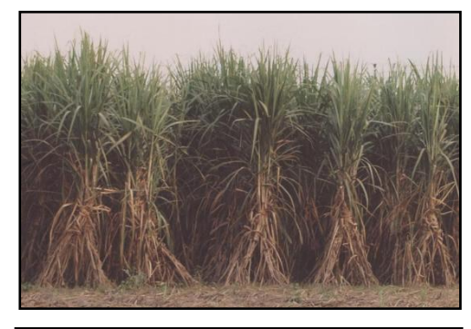
चित्र 08: Figure 08a: General view of crop