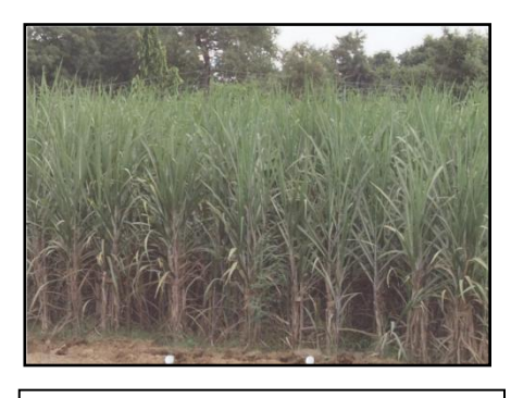
चित्र 07: Figure 07a: General view of crop