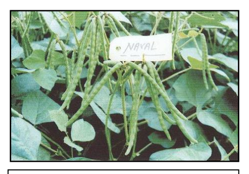
चित्र 01: Figure 01a: General view of plant type