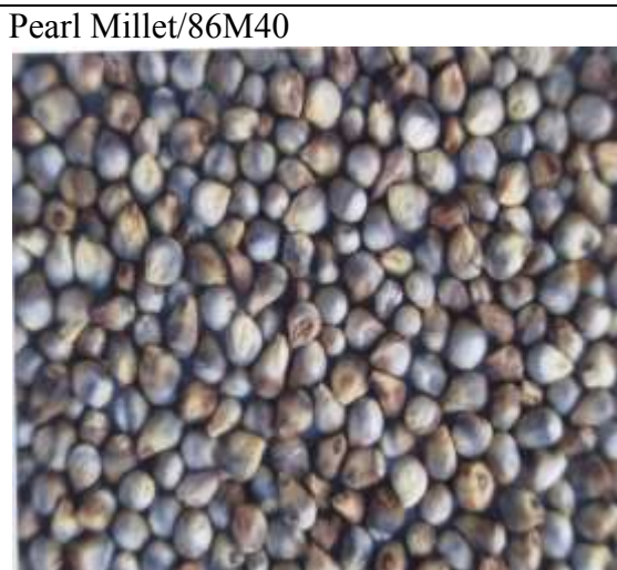
Figure 06: General view of seeds