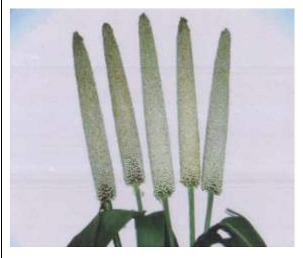
Figure 08: General view of spikes