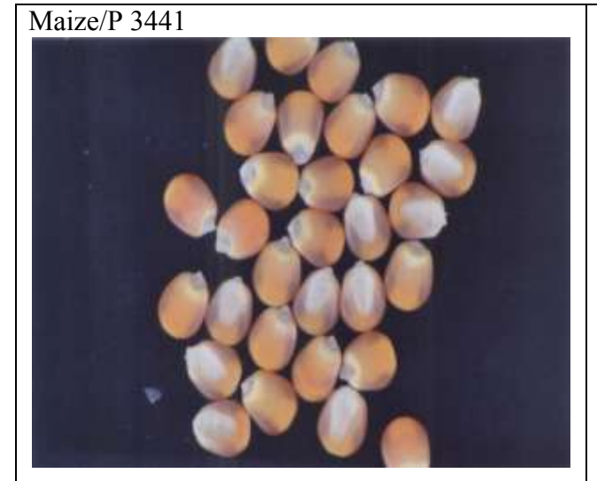
Figure 05: General view of seeds