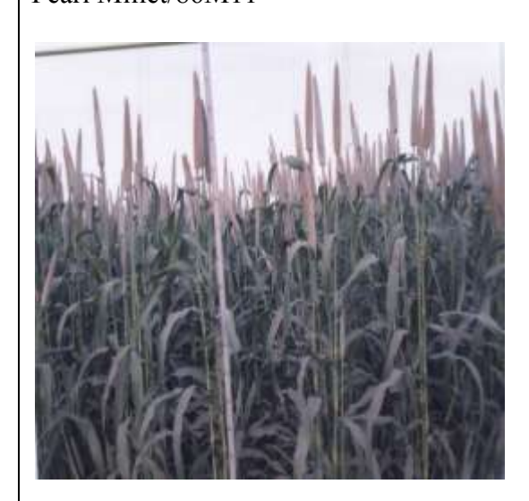
Figure 07: General view of plant