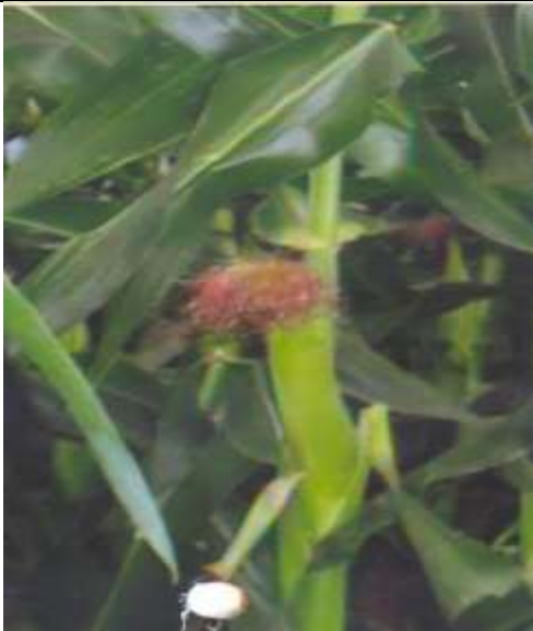
Figure 03. Anthocyanin colouration of silks: present