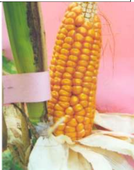
Figure 05. General view of Ear