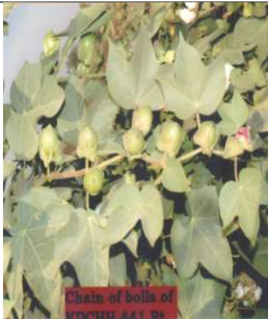
Figure 12. Leaf : colour light green