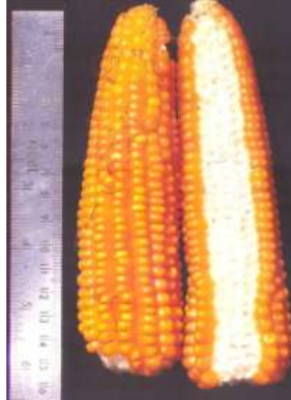
Figure 02. Type of grain semi-dent