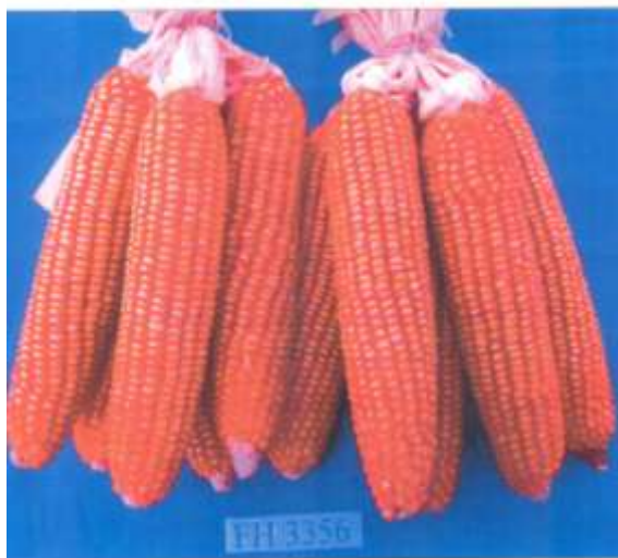
Figure 09. Ear: Colour of top of grain: Yellow with cap