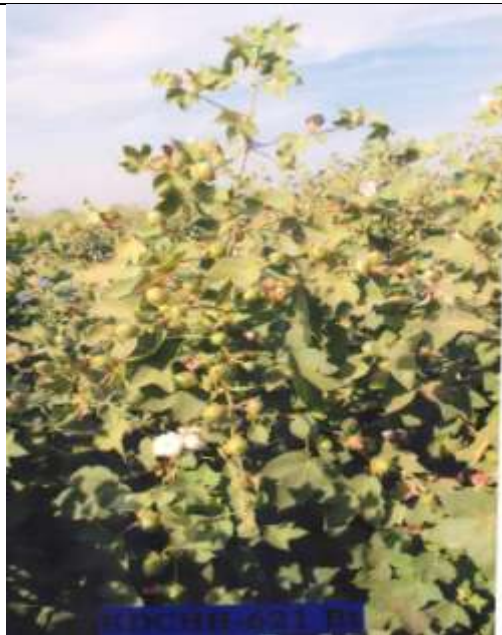
Figure 11. General view of Plant