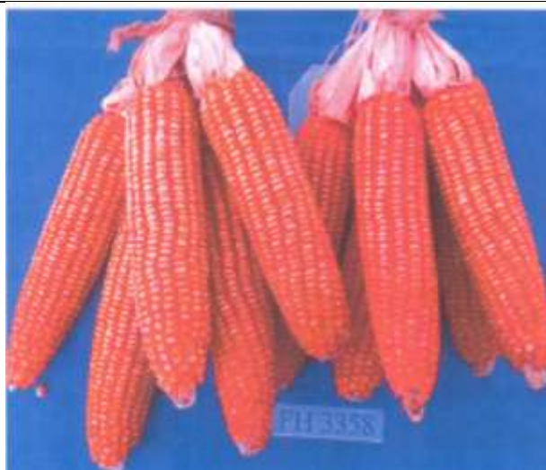
Figure 08. Ear: Colour of top of grain: Yellow with cap