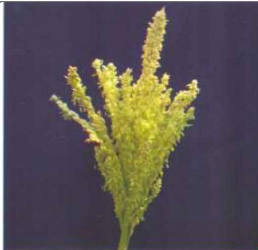
Figure10. Tassel: Angle between main axis and lateral branches: Narrow,