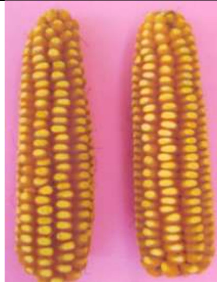
Figure 04. view of Ear: Anthocyanin colouration of glumes of cob: light purple