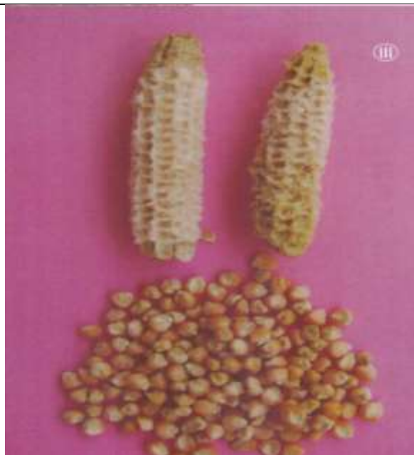
Figure 06. Ear: Colour of top of grain: Yellow with cap