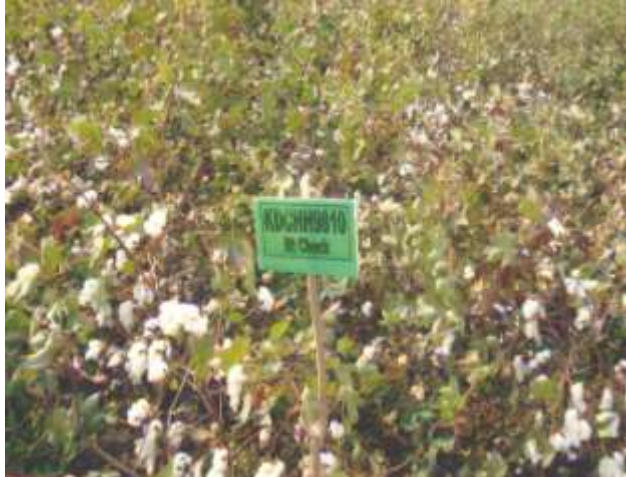
Figure 13. General view of Crop

Tetraploid Cotton/ DOLLAR MARUTI (KDCHH 9810 Bt)