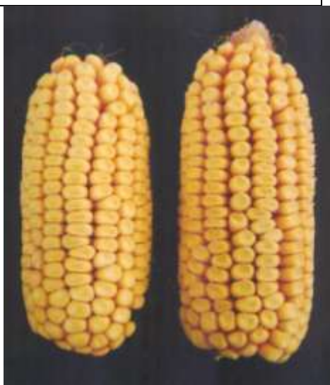
Figure 07. Ear: Anthocyanin colouration of glumes of cob : Dark purple .